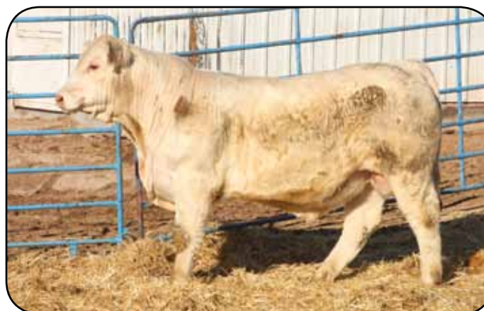
SCC Patriot 170K Pld