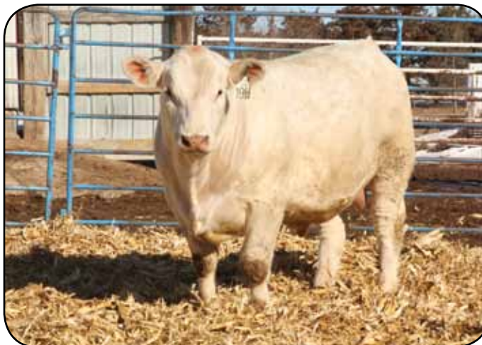
SCC Riptide 19H Pld