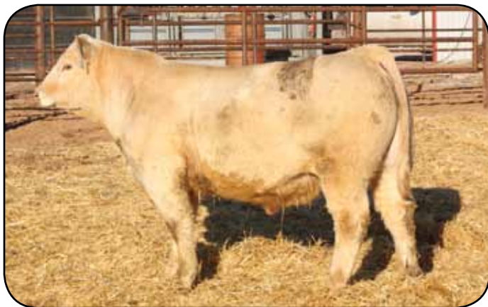
SCC Patriot 63K Pld