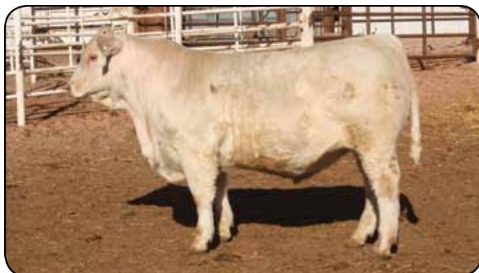
This top bull from the 2022 sale is a maternal brother to SCC Crossroad 66K Pld.