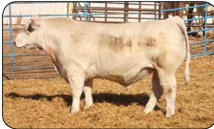
This top bull from the 2022 sale is a full brother to SCC Jesse James 146K Pld.