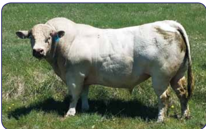
HCR Credit 416 Pld in his working clothes.