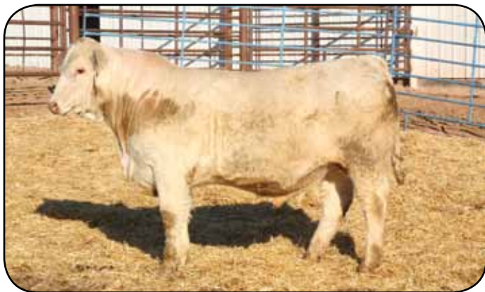
SCC Crossroads 149K Pld