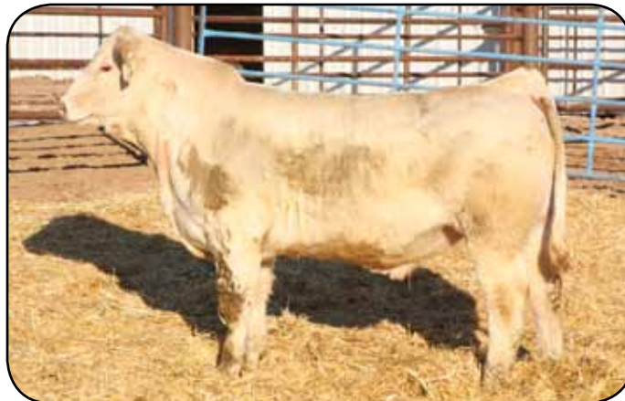
SCC Captain 97K Pld