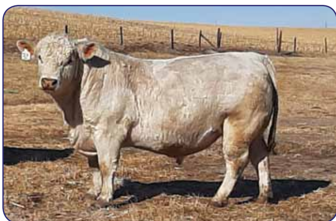
SCC Affinity 3F Pld