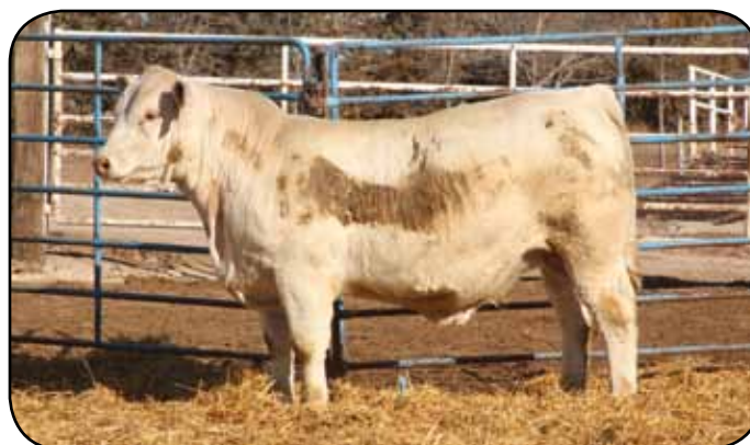
This top bull from the 2022 sale is a maternal brother to SCC Patriot 167K Pld.