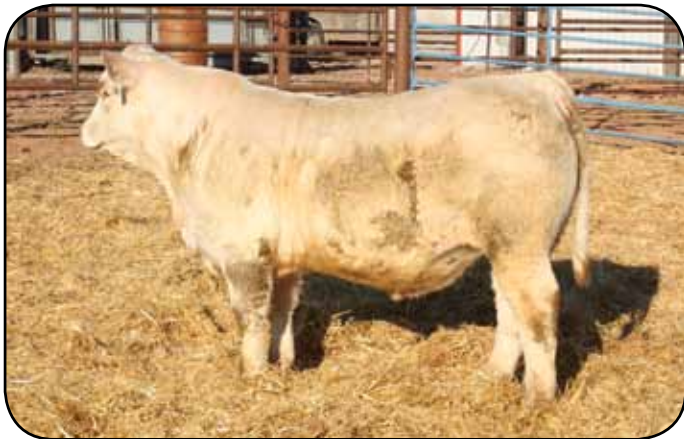
SCC Affinity 93K Pld