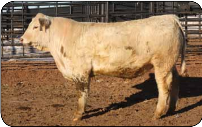
SCC Riptide 53K Pld