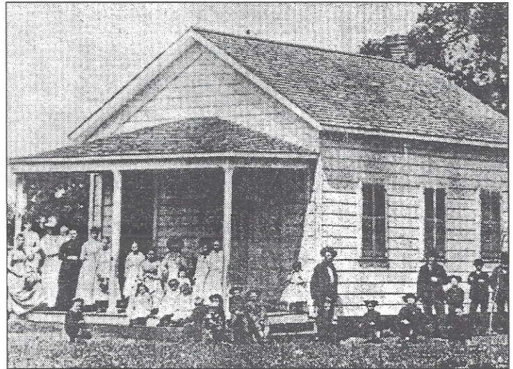
York School in 1888

the program, and refreshments will be available after the presentation.