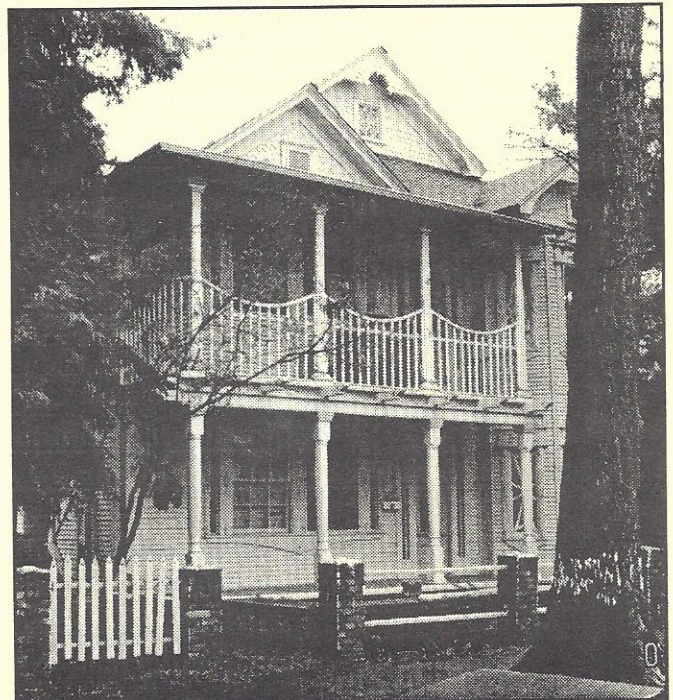
F.J. Boucher Home