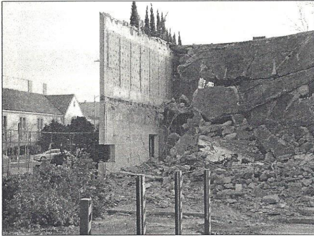
The mural wall just before demolition