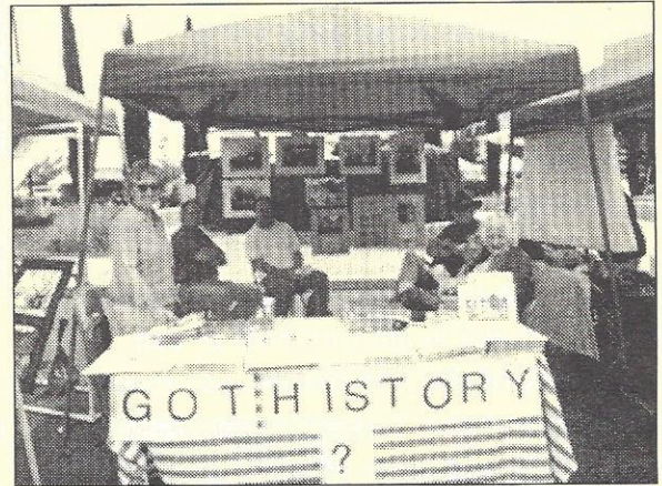
Our "Got History" booth at the Butte College Roadrunner Outdoor Market