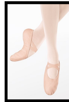
Split Sole Ballet Shoes