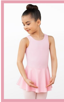
Leotard Option A