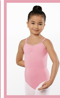
Leotard Option B