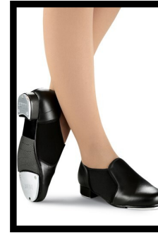
Slip On Tap Shoes