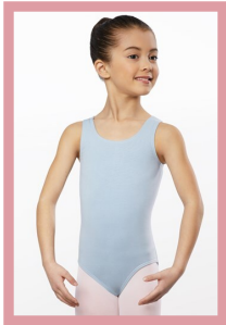
Dancers Choice of Color and Style