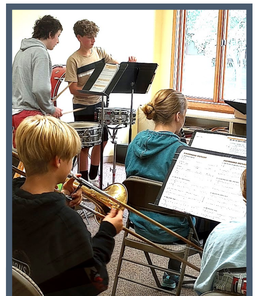
Brass, Woodwinds, and Timpani - SJA students are learning and growing every day. It's music to our ears.