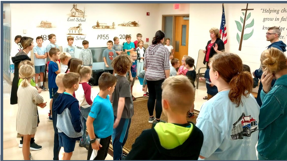
Every morning St John students and teachers gather for morning prayer, pledges, and announcements.