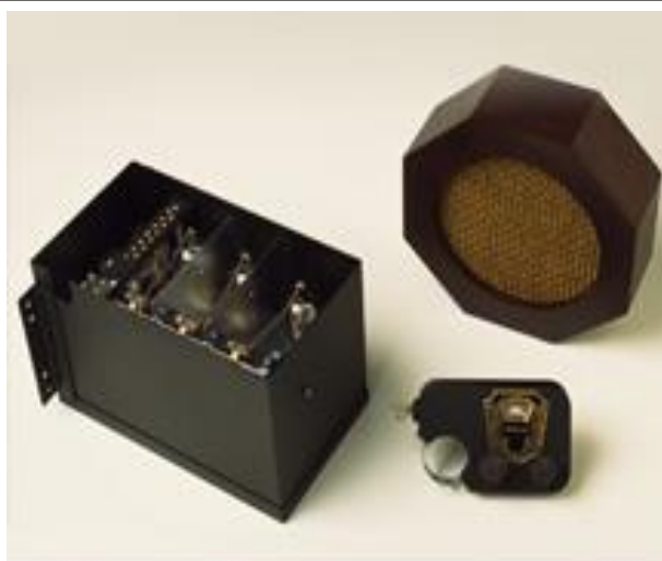
This reproduction of Motorola's first car radio, 1930's model 5T71, included (left to right) a radio receiver, tuning control and speaker.

But what he's really famous for are his contributions to the field of aviation. He invented radio direction finders for planes, aided in the invention of the autopilot, designed the first fully automatic aircraft landing system, and in 1963 introduced his most famous invention of all, the Lear Jet. The world's first mass-produced, affordable business jet. (Not bad for a guy who dropped out of school after the eighth grade.) Sometimes it is fun to find out how some of the many things that we take for granted actually came into being! AND ...It all started with a woman's suggestion!! website-(radio-waves.co.nz)