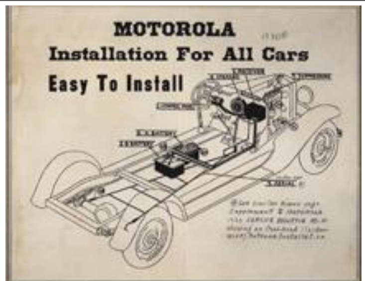
A Motorola car radio installation diagram (circa 1930) showed batteries, spark plug suppressors and the antenna, in addition to the radio components.