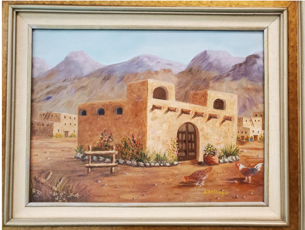
“Adobe Village” Oil By Sheila Bellinger