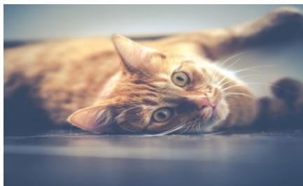
A Vet Speaks Out On Clean