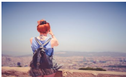
How To Tell If A Fashion Brand Is