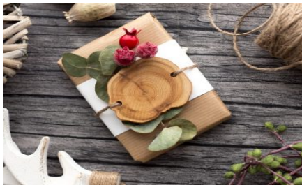
Stuck for Ideas? Our Ethical Gift