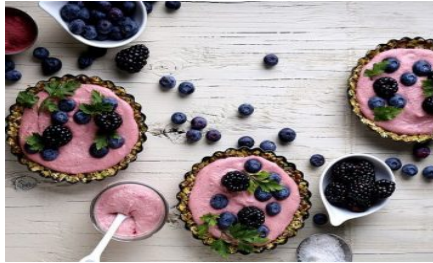
Have Your Cake & Eat It: 15 Raw