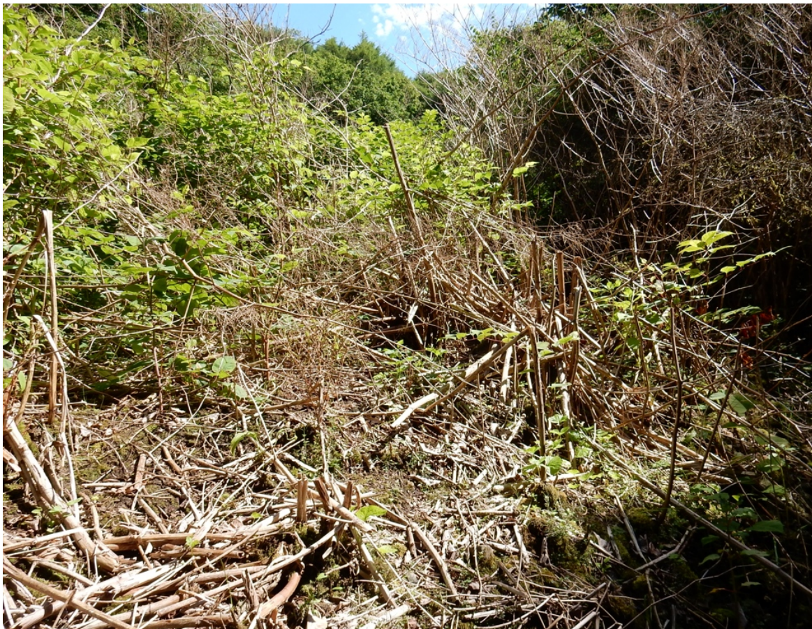
Photo taken Ilston Valley, Penmaen 10 July 2015. Dakar Pro has been sprayed over Japanese Knotweed since March 2015, but new shoots are emerging by July. This is due to resistance by gene amplification