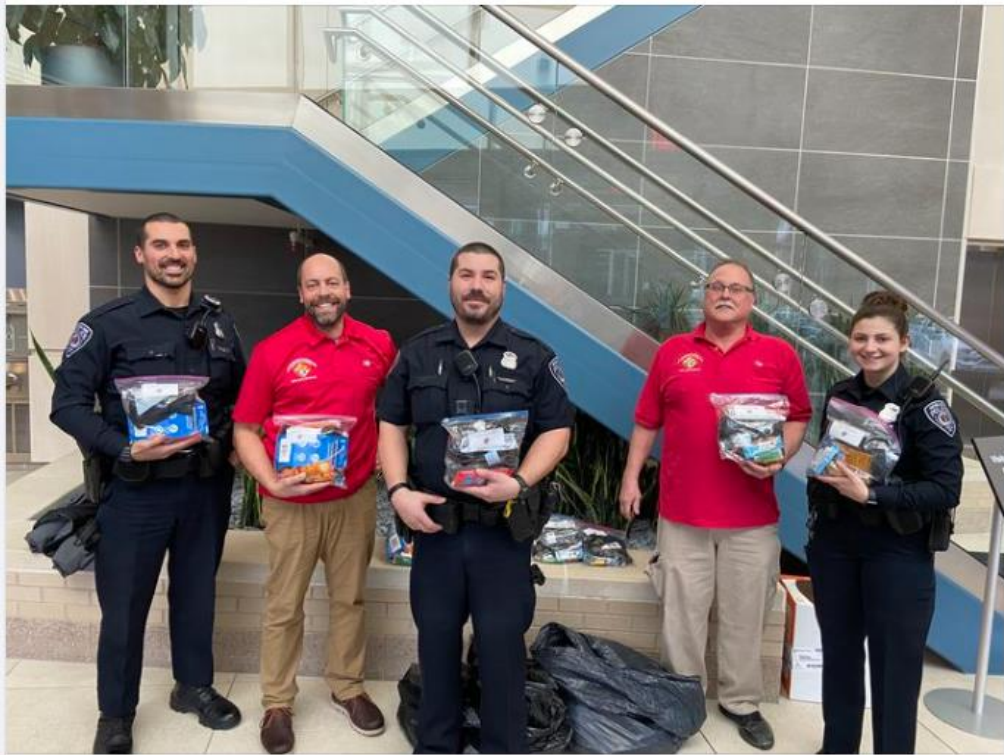
Packaging care bags for the Royal Oak Police Department to distribute