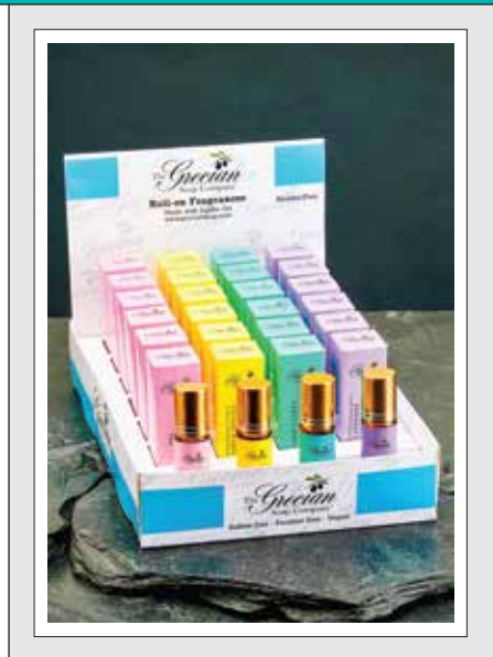
Dimensions: 10"w x 6.5"d x 6"h

Our new Roll-on Fragrance Display is the perfect addition to any retail space. It's a countertop display that includes 6 each of 4 fragrances. You may choose the fragrances or let us send our most popular scents.