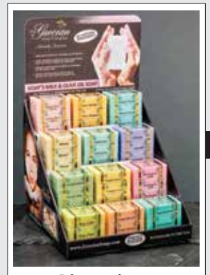
Dimensions: 12.5"w x 12.5"d x 20"h

Standard cardboard bar soap display includes 50 soaps.