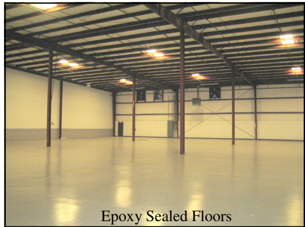
Epoxy Sealed Floors

Take beltline to Hwy 70 East then go 1.5 miles south on Hwy 401. Look for large tenant directory sign on right. Turn onto Express Drive. Building is second on the left.