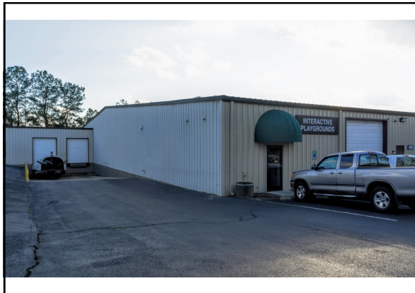
Two Dock High Doors, One Drive-In