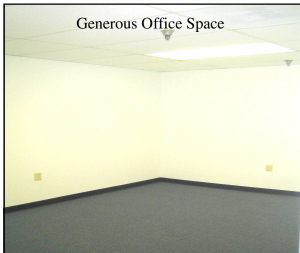
Generous Office Space