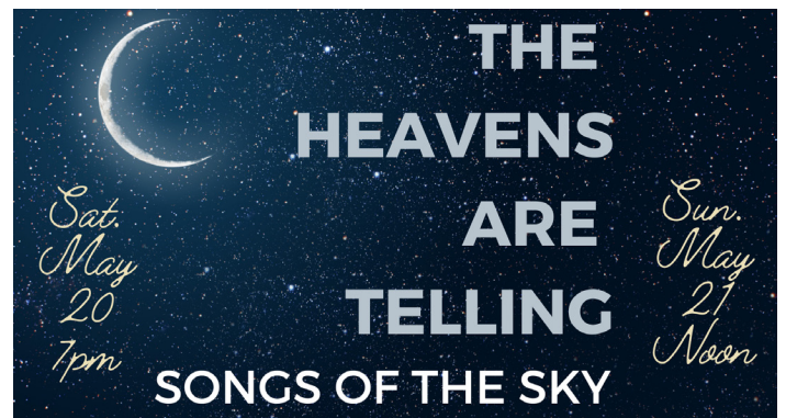
Spring 2023 Choir Concert