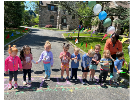
Nursery School Spring 2023

W e had a wonderful end to the 2022-23 Union Cong Nursery School. With 98 families and 18 faculty members, we created a successful supportive community for all to grow. Our final fundraiser was our annual Union Cong Fun Run raising over 1,200 to benefit the Human Needs Pantry.