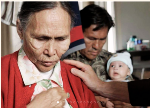
Parishioner receives a blessing

Showing in Upper St. Ann's Hall, Oct. 17 (Tuesday) at 7pm. Jointly sponsored by The Knights of Columbus and The Catholic Women's League. Everyone is welcome...refreshments provided.