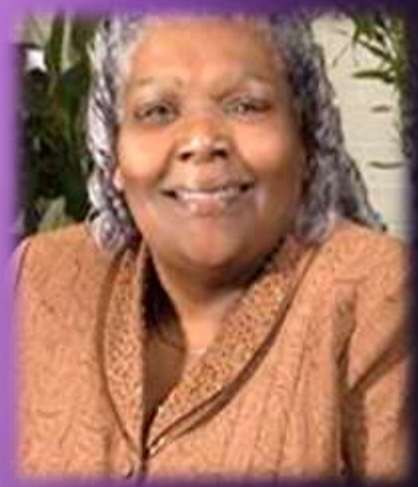
Angel Tree Ministry