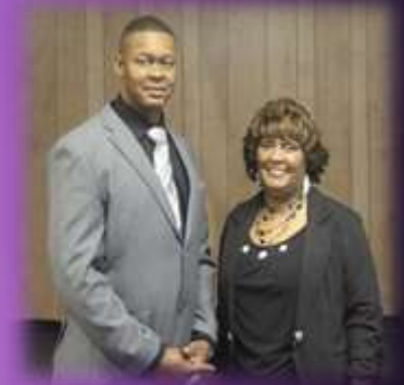
Youth Orientation Counselor Youth Counselor