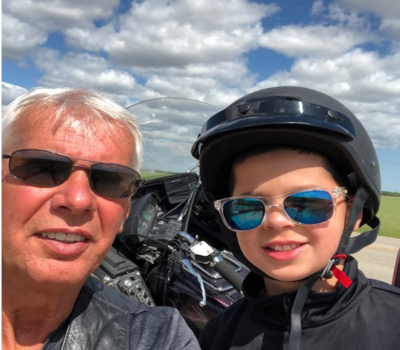
ST. ANDREWS RIDE