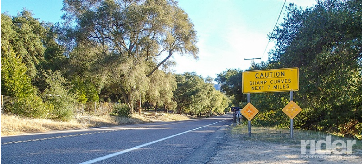
You can't say they didn't warn you. There is some serious climbing and twisting ahead to reach the Palomar Mountain summit.