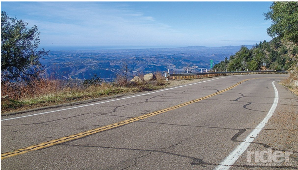
Don't look down! It's a nearly 2,500-foot drop from the summit of South Grade Road to the valley below.