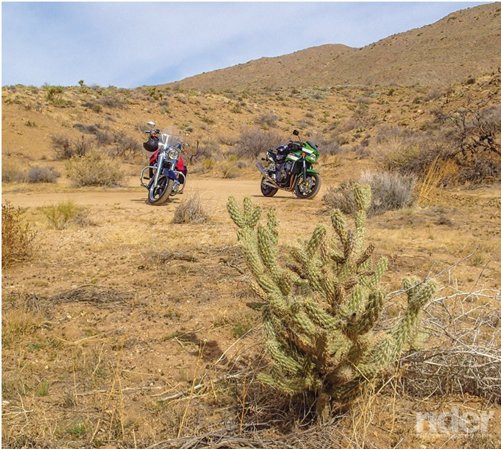
Only 45 minutes from the summit of Palomar Mountain, and the scene has changed from pines to cacti as you skirt the border of the Anza-Borrego Desert State Park.

The scenery changes and gives quite a variety to enjoy.