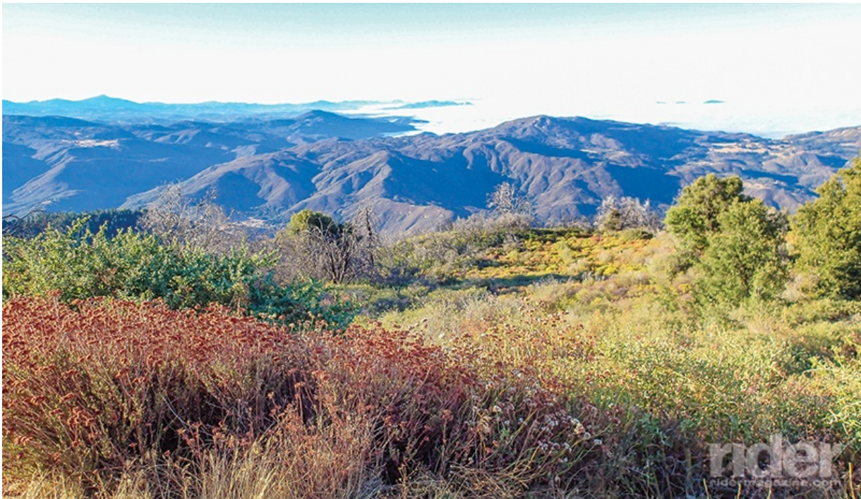
A clear day on the mountain. The marine fog layer from the Pacific encompasses the valley to the west and the hills of Mexico can be seen to the south.