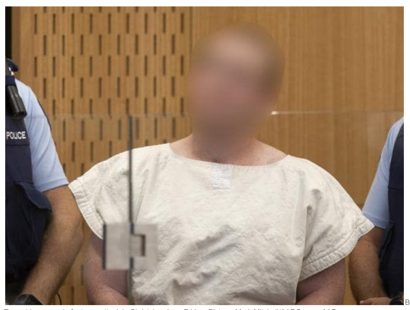
Tarrant is accused of a terror attack in Christchurch on Friday.

From what we understand, the shooter was a right-wing extremist, a so-called white supremacist.