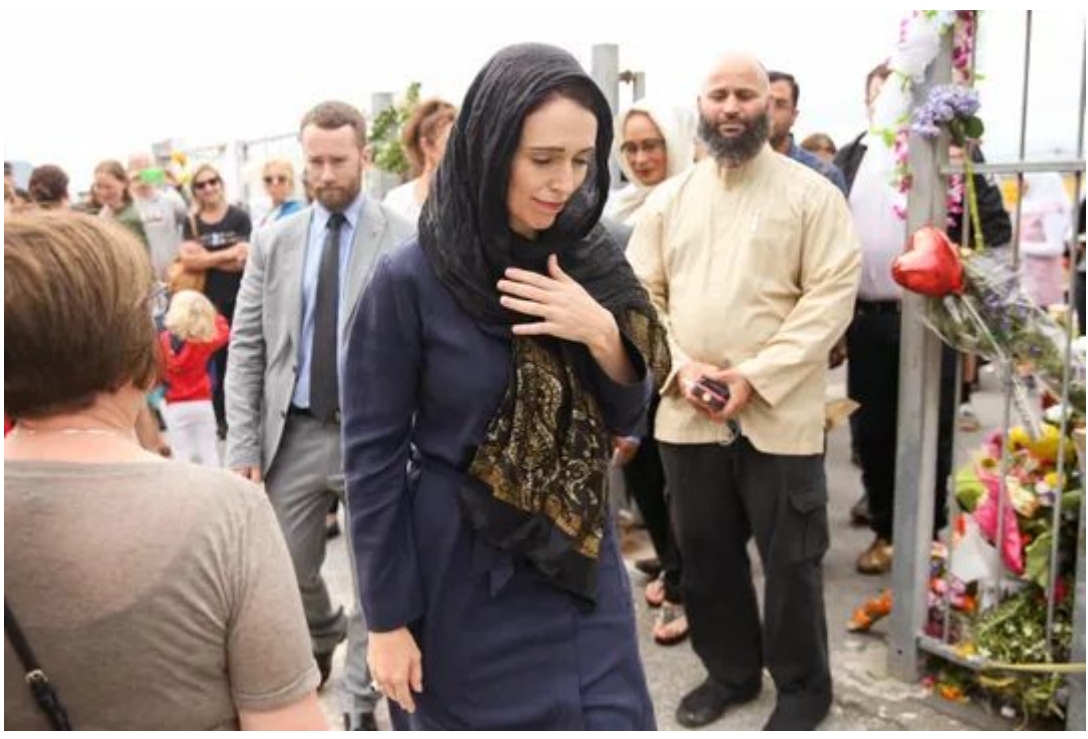
Prime Minister Jacinda

Indeed, one of the most heartening and gratifying things to observe, both in New Zealand and here in Australia, is how the incident has drawn people together in mourning and expressions of genuine sympathy and support. One of the hand-made signs prominent amongst all the flowers outside the mosque in Christchurch simply read: This is not us!