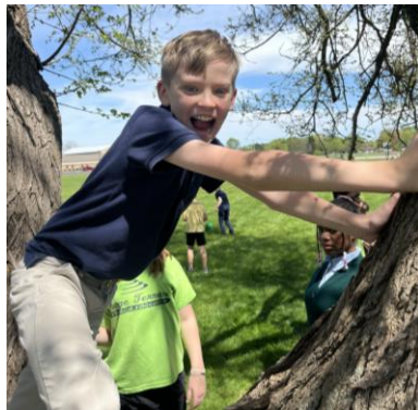
A trip to "the tree" is always a good idea!