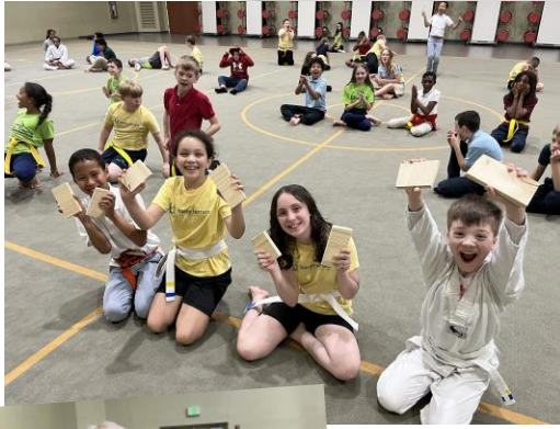
More Yellow Belt achievers