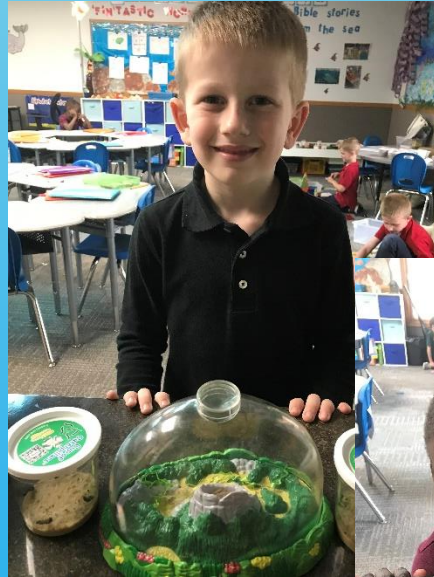
Watching caterpillars and ladybug larva grow.