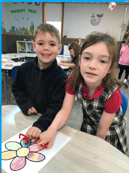
Learning about pollinators