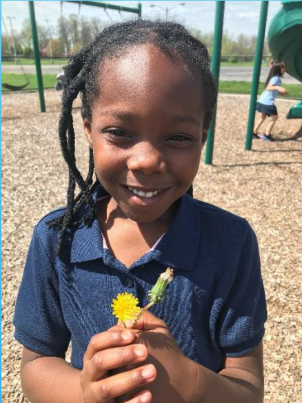
Comparing two dandelions to learn about the life cycle of a dandelion.