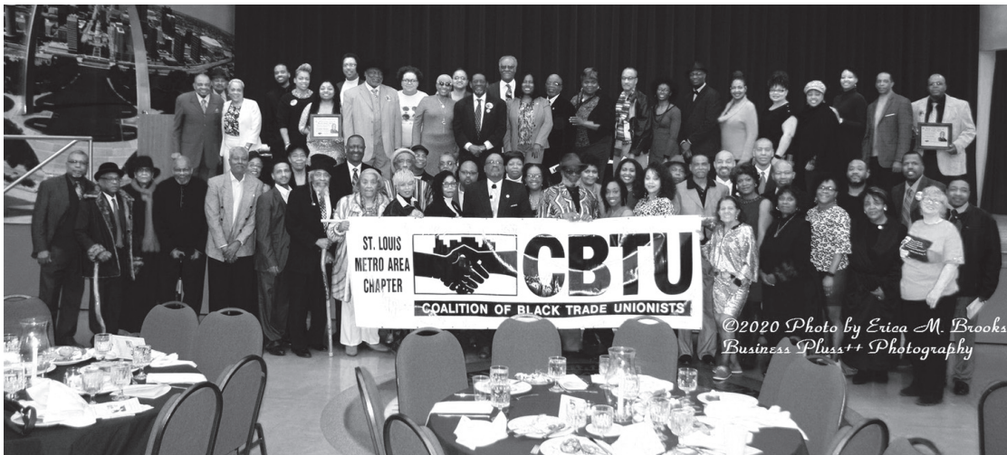
Coalition of Black Trade Unionists Banquet