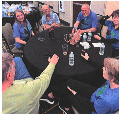
Pizza, games, and laughter after a long day at the Ark.