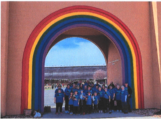
Our group standing under the rainbow at the end of our day. The rainbow is the symbol of God's promise that there will never again be a flood to destroy the earth.

The Ark group had a wonderful time in Kentucky visiting the Ark Encounter and Creation Museum! This intergenerational trip allowed members of our congregation time together for fellowship and the opportunity to see the magnitude of how big Noah built the Ark. This trip would not have been possible without the support of our congregation! Our group would like to THANK YOU for donations to the Travel and Share fund and our fundraisers. We are blessed to have your support giving members of our congregation opportunities like this.