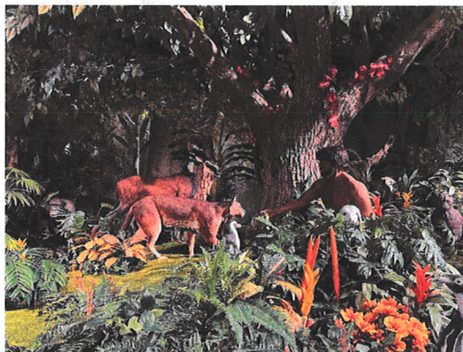
An exhibit with Adam in the Garden of Eden.