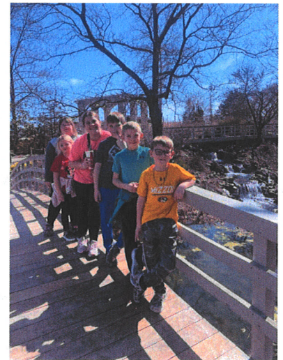
The kids took advantage of the nice weather to walk on the walking path at the Creation Museum.