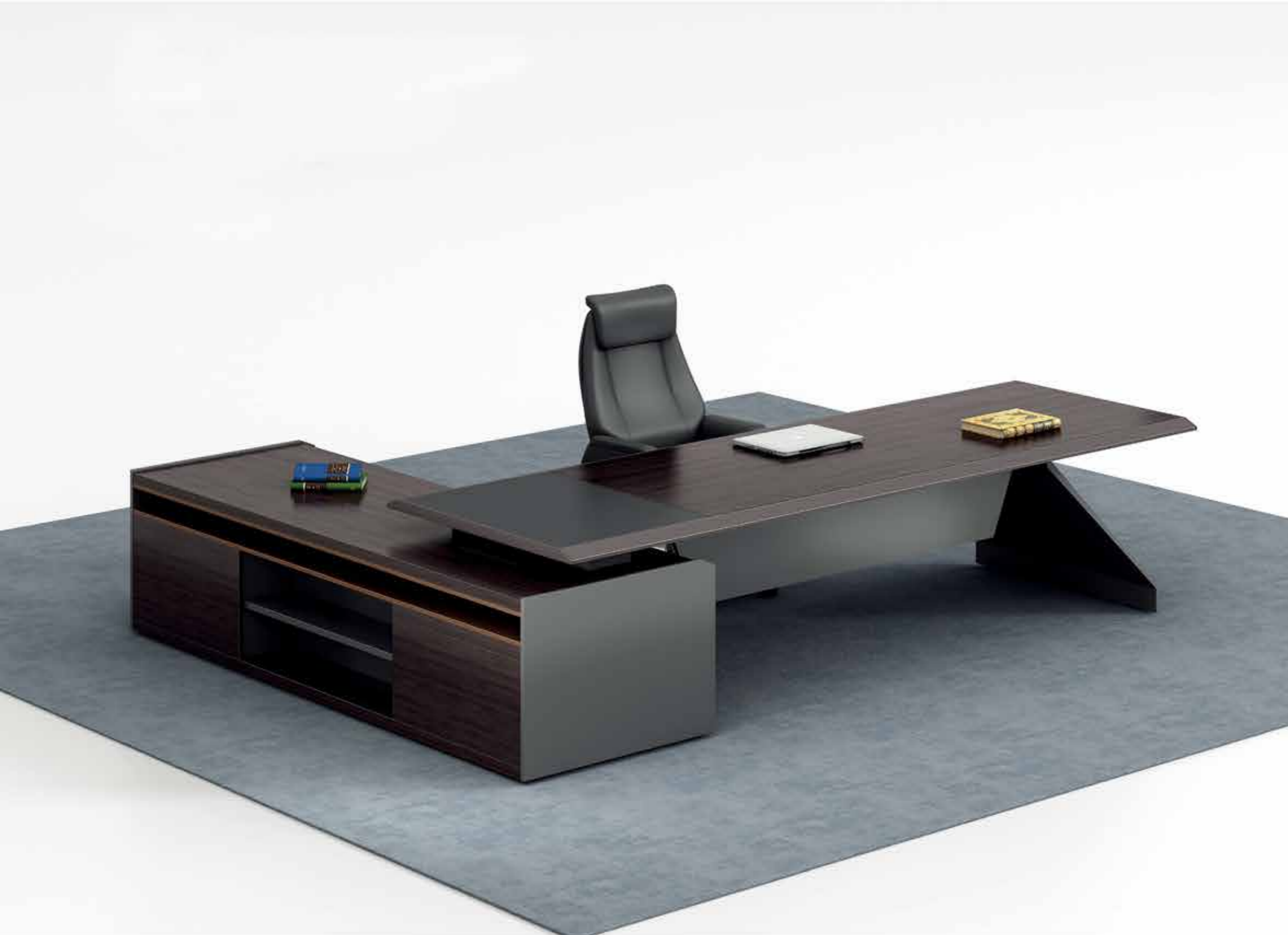
Executive Desk MODEL_SZ-A203 Size_W3000*D2200*H770.mm

Quietly elegant, To express an unexaggerated fashion, Experience an elegant nobility, Pure natural and pure fashion, Free and indulgent. From here for real life. Elegant and elegant shaping. The tender and delicate feeling makes everything so comfortable and natural.