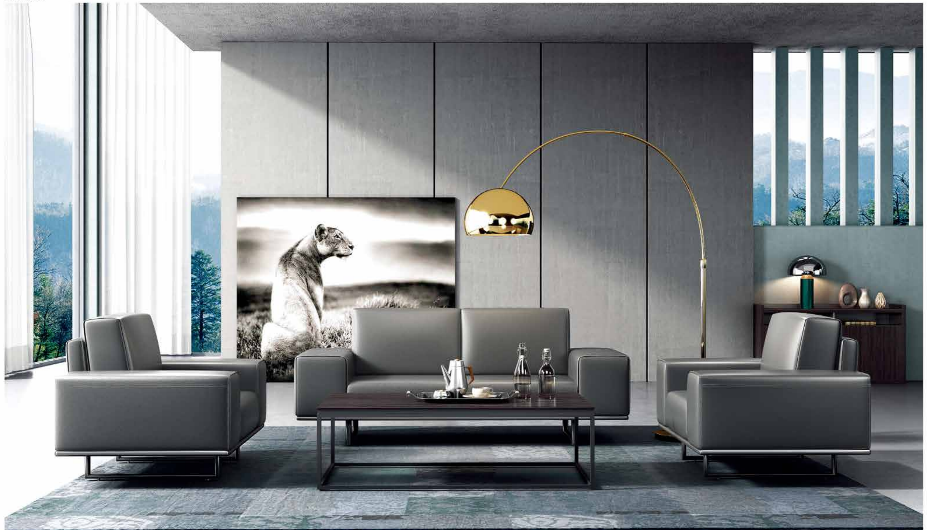
Square coffee table MODEL_ SZ-T101 Size_W700*D700*H450.mm