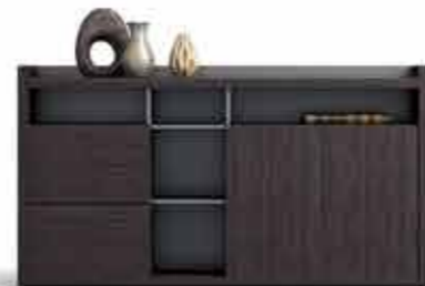
MODEL_ SZ-D102 Size_ W1500*D400*H900.mm