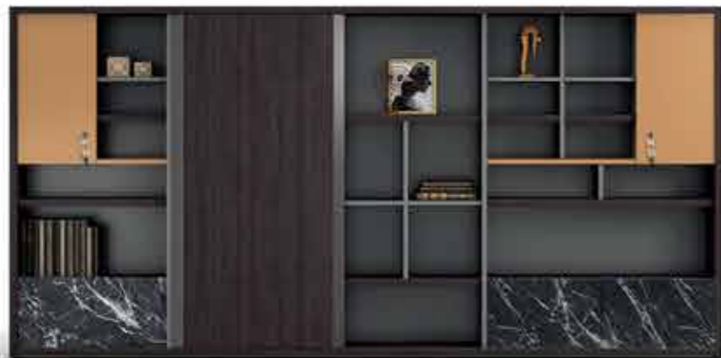
MODEL_ SZ-B202 Size_ W3645*D480*H2000.mm