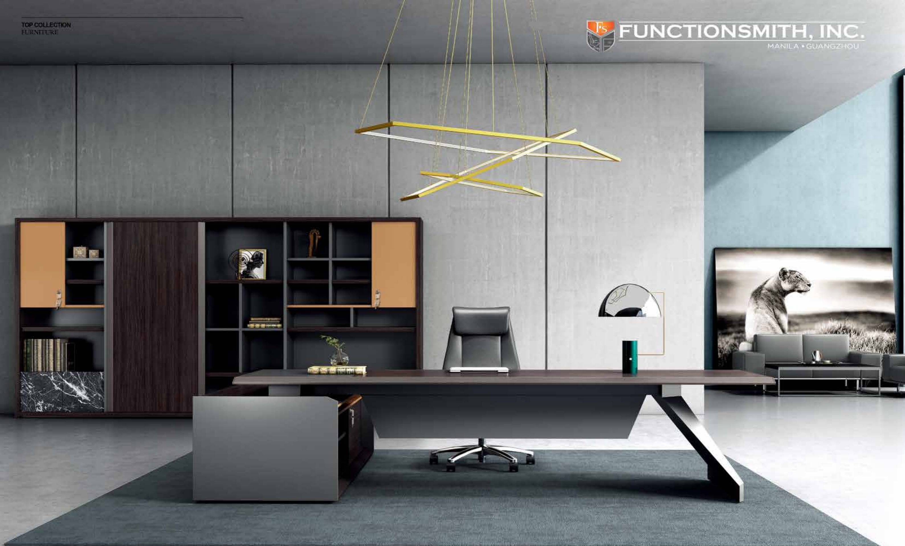
Executive Desk MODEL_SZ-A203 Size_W3000*D2200*H770.mm