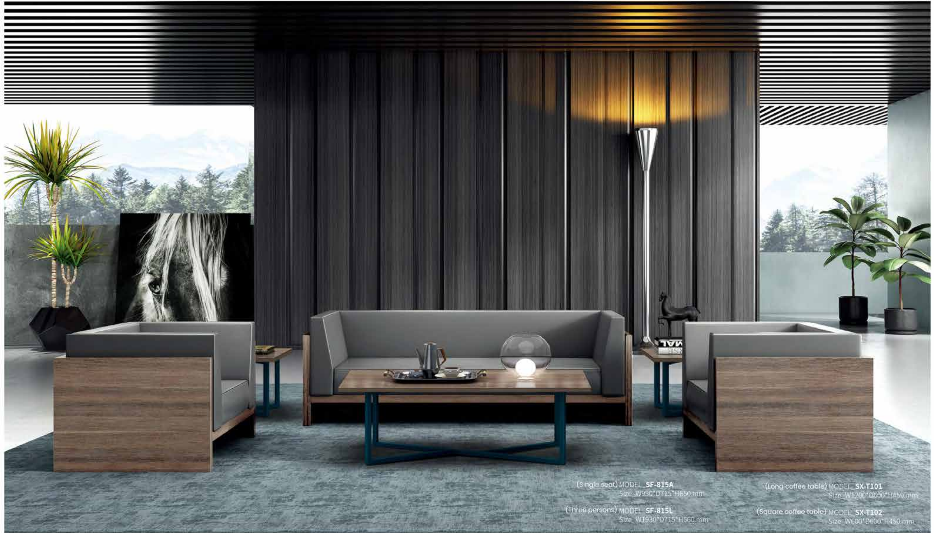
(Single seat) MODEL SF-815A Size: W930*D715*H660 mm