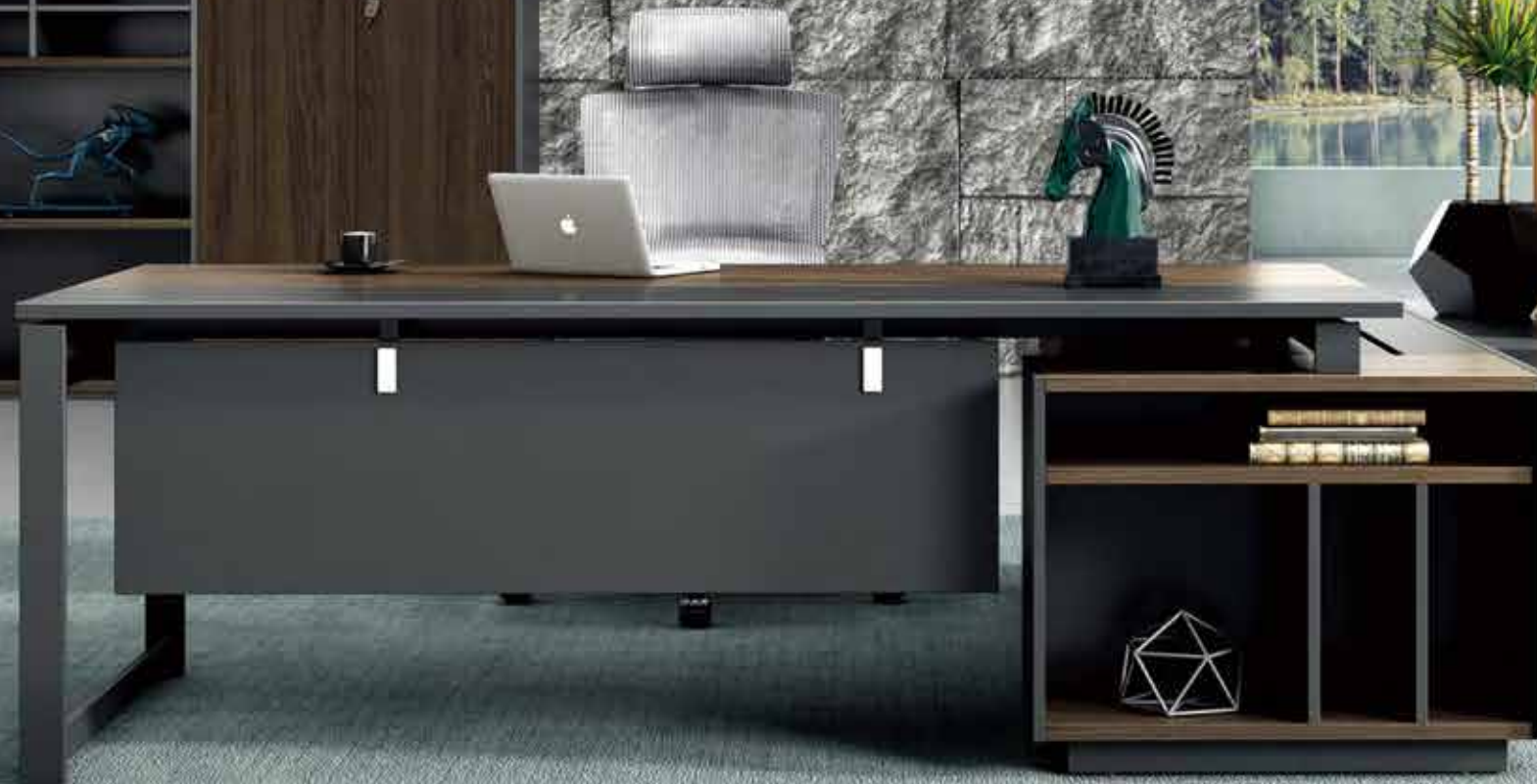
Manager desk MODEL_SY-A103 Size_W2000*D1700*H750.mm