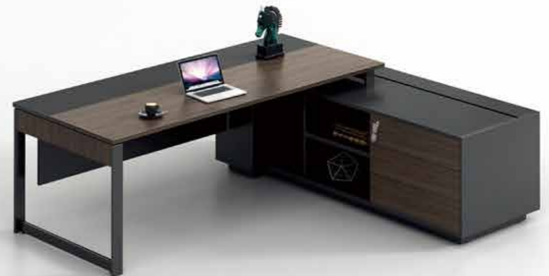
Manager desk MODEL SY-A103 Size_W2000*D1700*H750.mmm

Delicate techniques professional designs, simple and essential, every single detail is abortively examined to guarantee high quality, everything bears the soul and essence of outstanding craftsmanship.