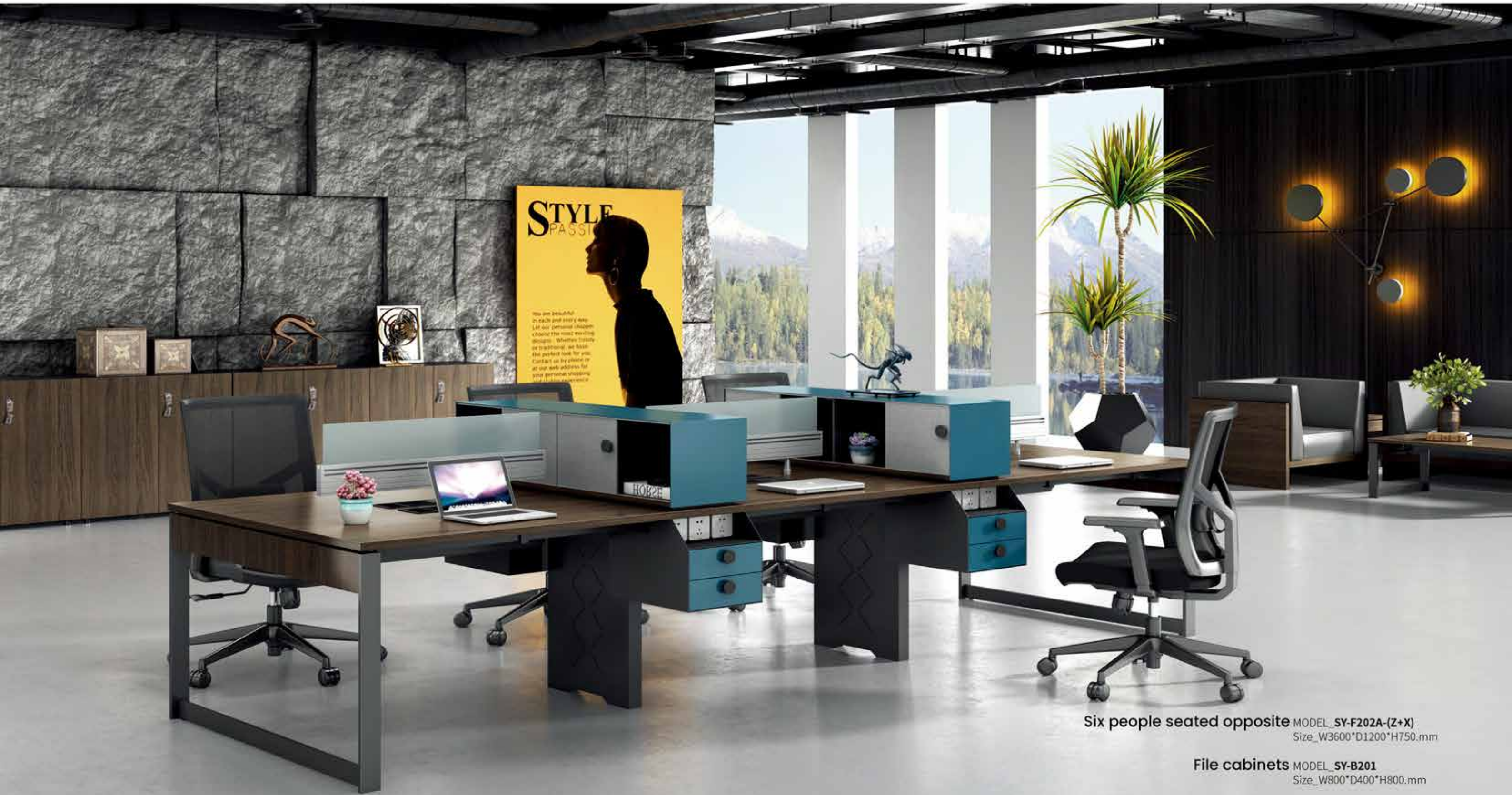
Six people seated opposite MODEL_SY-F202A-(Z+X) Size_W3600*D1200*H750.mm