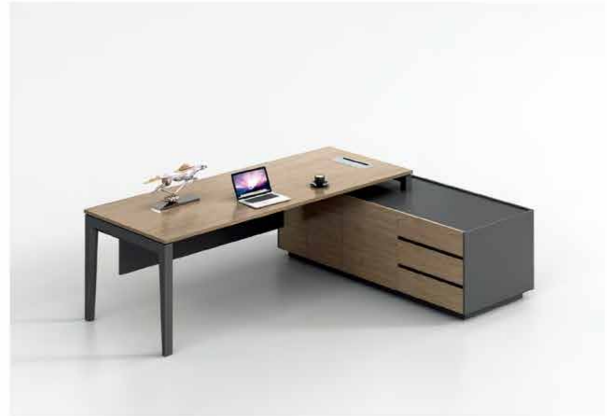
Manager desk MODEL_XSJ-A101 Size_W2000*D1700*H750.mm

Quietly elegant, To express an unexaggerated fashion, Experience an elegant nobility. Pure natural and pure fashion, Free and indulgent. From here for real life. Elegant and elegant shaping. The tender and delicate feeling makes everything so comfortable and natural.