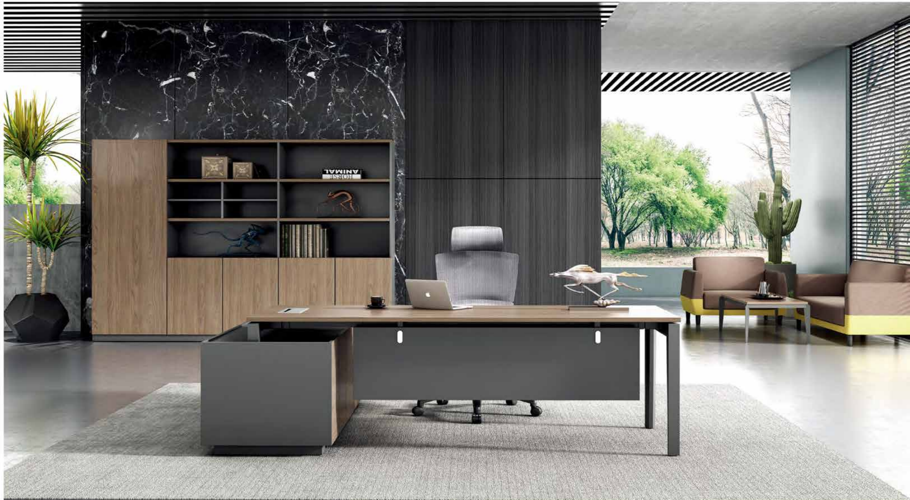
Manager desk MODEL_XSJ-A101 Size_W2000*D1700*H750.mm