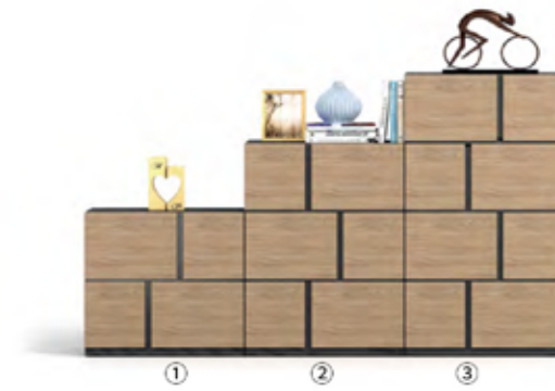
MODEL_ Size_ ① XSJ-B201 W800*D400*H800.mm ② XSJ-B202 W800*D400*H1183.mm ③ XSJ-B203 W800*D400*H1566.mm