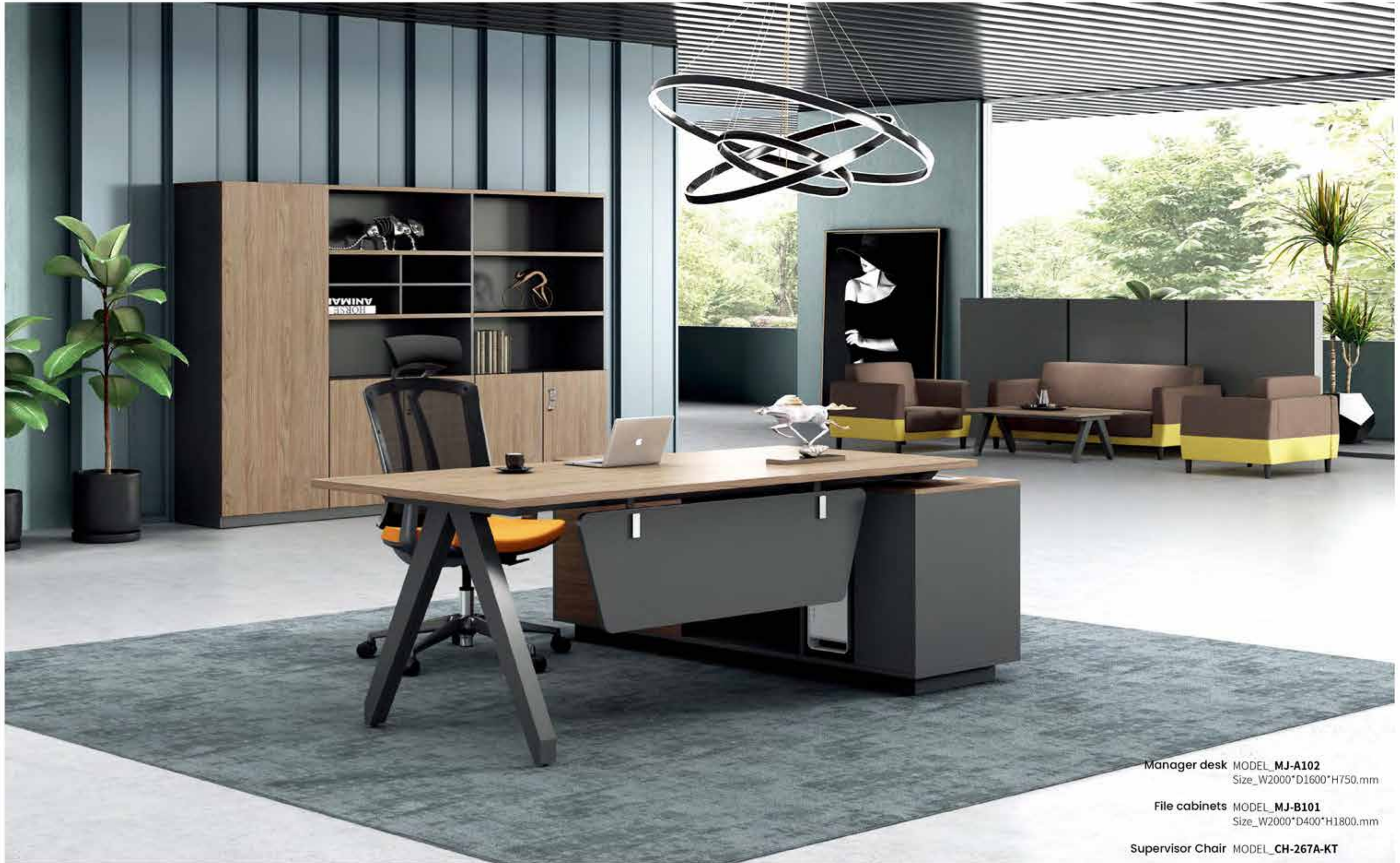
Manager desk MODEL_MJ-A102 Size_W2000*D1600*H750.mm