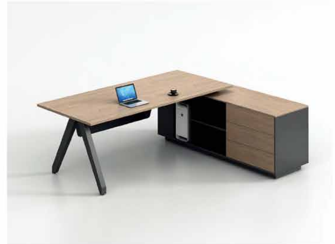
Manager desk MODEL MJ-A102 Size_W2000*D1600*H750.mm

The material from nature, the beauty of classic! Fashion and dignity are also included in the design. Rush, rush, rush. Finally you can enjoy the coziness of life.