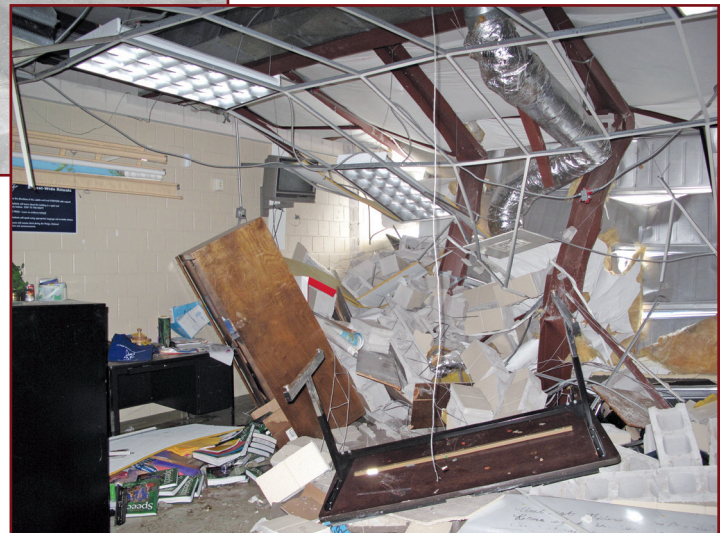
Figure 3 – Interior shot of collapse.