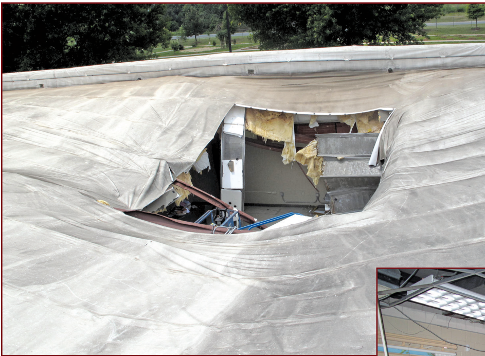
Figure 2 – This same building roof collapsed due to several factors related to a single-ply re-cover.