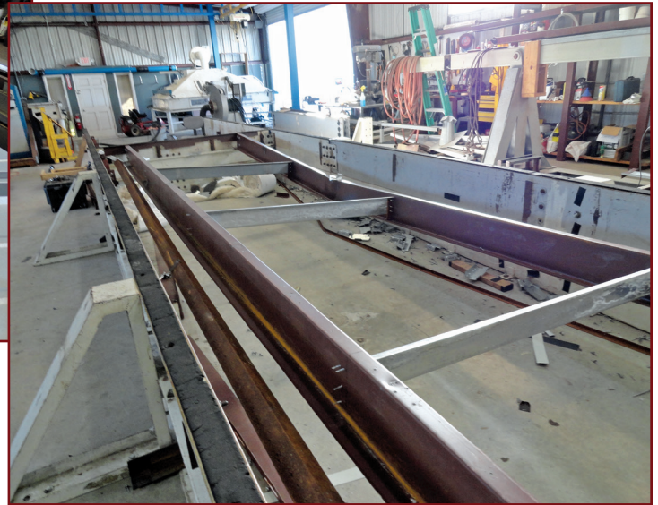
Figure 5 – Purlins after base test failed at 23.5 psf.

bays rose and forced the water from the two adjacent bays into the wider span bay where the low spot occurred. It also prevented water from reaching the overflow and adjacent scuppers because the eave strut had not deflected along the parapet wall. As a result, it took a matter of minutes for the roof to collapse.