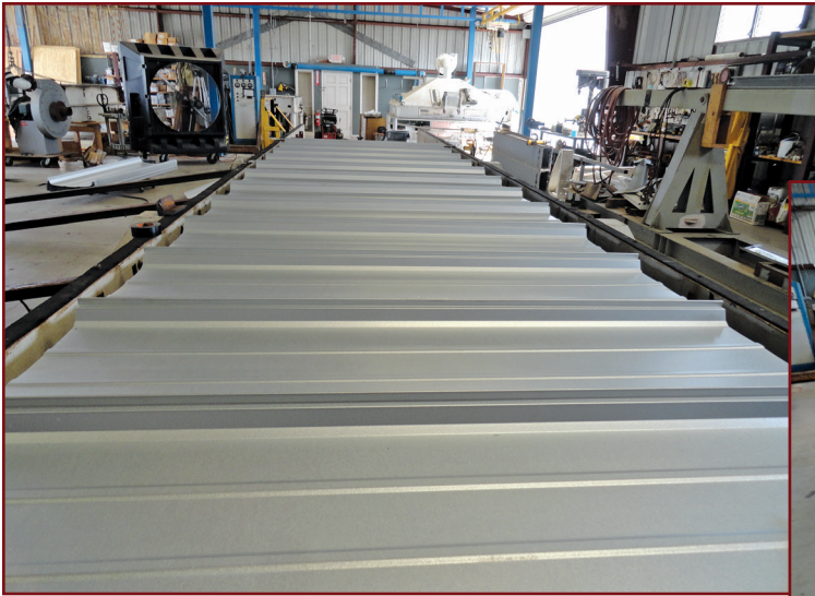
Figure 4 – Roof panels mounted on purlins prior to base testing.