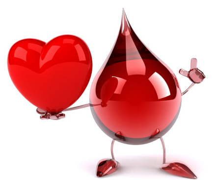
Calling All Blood Donors

The Blue Star Mothers – LV Chapter PA201 are planning a Troop Packing on October 8 and need the following items to send to service members both overseas and here in the states. We also donate items to the various Veterans homes in the area. We would be very grateful if you could donate whatever you can to help us out and support our troops. We recommend the following items be travel size ... Shampoo, Deodorant, Body Wash; also needed are Baby Wipes and Granola Bars/Nut Snacks. Please place the items in the box in the church foyer, by October 2. Thank you in advance for your support. If you have a son/daughter, other family member or friend who is in the military and would like them to receive a package, please send their name and address to Bonnie Sankovsky at BonnieSankovsky@gmail.com and we will add them to our mailing list. If you have any questions, or would like more information, please call Bonnie at (610) 216-7836.