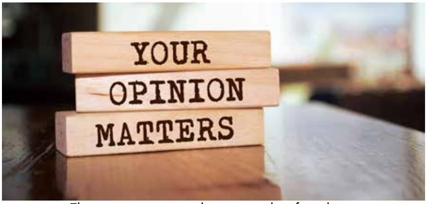
These questions are also in an online form here: https://forms.gle/sGs341rBcZiTxL8Y6

Would you be interested in helping organize an event?