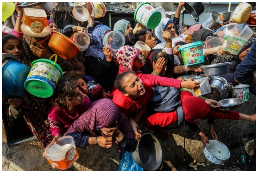
Whitehall Food Pantry

If you would like to make a contribution to UCC National for its work in Israel, Palestine, and Gaza, please mail your donation into the church office, place it in the offering plate, or contribute online or by text. You can also find General Disaster Fund envelopes on the table in the lounge area. Be sure to put "Middle East Support" in the memo section.