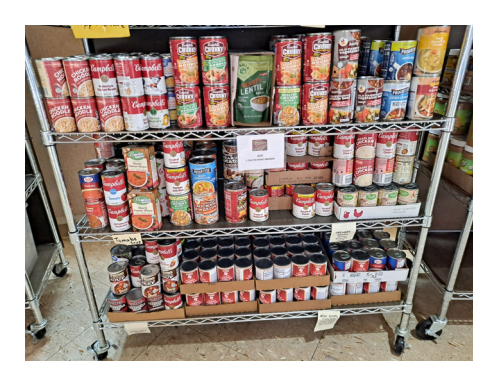
Whitehall Food Pantry

For the month of April, we are collecting macaroni and cheese, boxes of rice, jelly, pancake mix, and cereal. Any other nonperishable food items are always welcome. A shopping cart can be found in the coatroom area by the sanctuary where you can place your donations. Monetary contributions are always accepted and can be forwarded to the church office, placed in the offering plate, or given online or by text. For more information, contact Gary Black at <u>gary.t.black@outlook.com</u> or (484) 274-2405. Be sure to read the article and pictures in this newsletter about what our volunteers do at the food pantry.