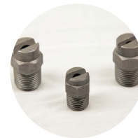
HARDENED SPRAY TIPS