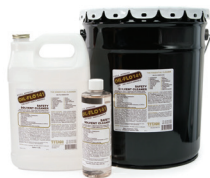
OIL FLO SOLVENT CLEANER