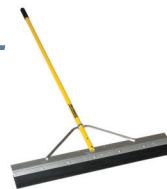
ASPHALT LOOTS, BROOMS, SQUEEGEES, ETC.