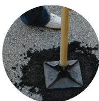
ASPHALT COLD PATCH