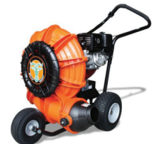
BILLY GOAT BLOWER, GRAZERS AND PARTS