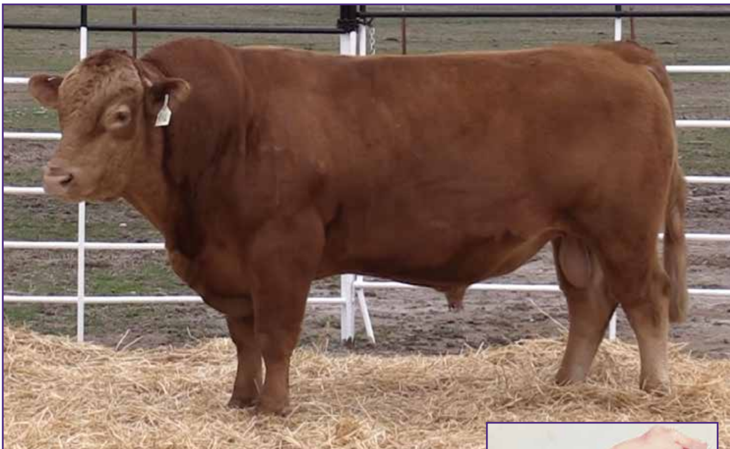
ACE AGF TANK 916 ET