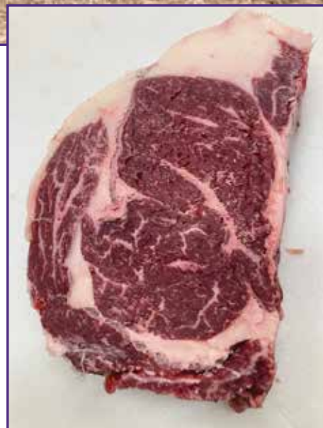
50% Tank 916 50% RaxSim

Please bring your catalog with you sale day!