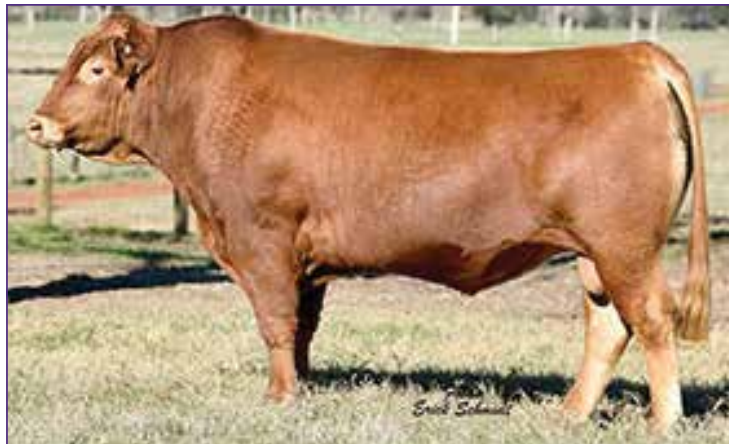
Heartbrand Rhubarb 2142A