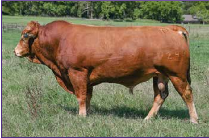
HB Hot Dam 9249E (AF103980)