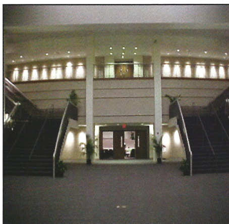
New Birth Missionary Baptist Church Lithonia, Georgia