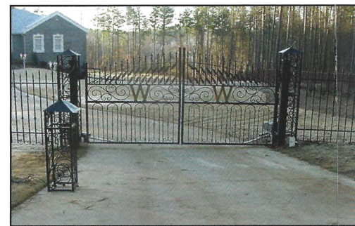
Custom Residential Entry Gates