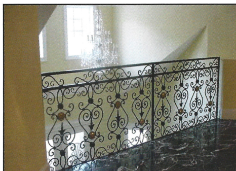
Custom Balcony Rails