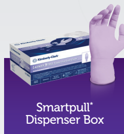
Smartpull* Dispenser Box