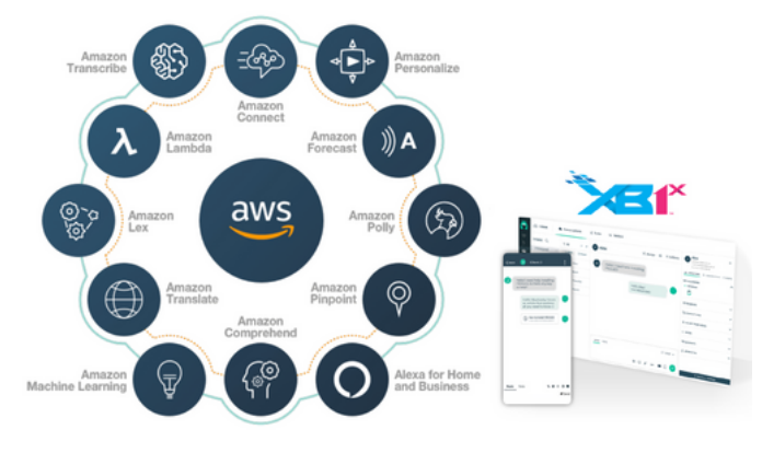
unicate through multiple channels, providing them with omnichannel attention is crucial No extra effort is required