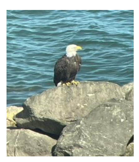
Cont., page 3