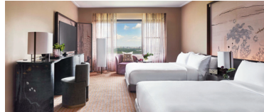
Studio Suite 500/sf