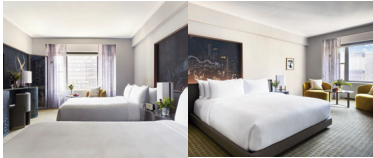
City View 300/sf

Room assignments will be made on a first-come, first-served basis after January 29, 2024.