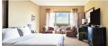
Park View 430/sf