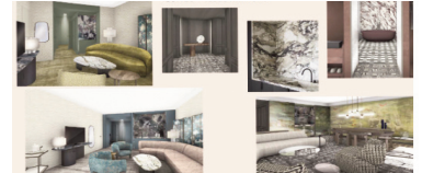
1 Bedroom Suites 760-820/sf

No Bed Removal | Check-in Time starts at 3:00 pm