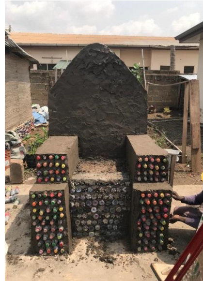
Plaster the throne with cement mortar