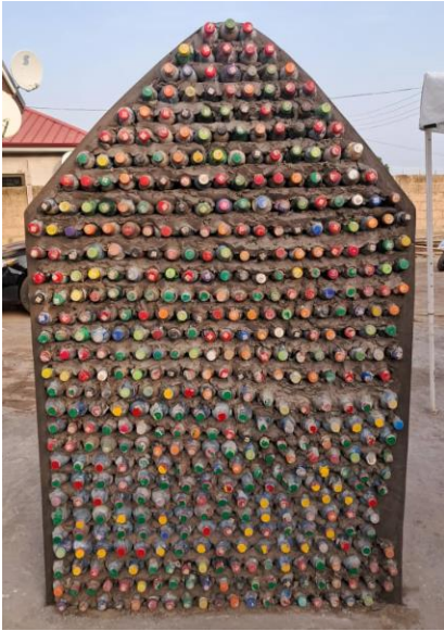
Raise the back of the throne as shown