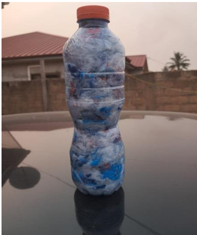
500ml bottle filled with 50 sachet bags equal 1 ecobricks