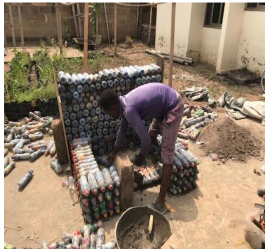
Start forming the throne with MORE ecobricks