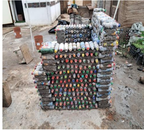
Raising the arm rest of the throne as shown