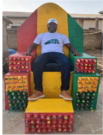
Leave it to dry then paint as shown