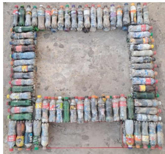
Start constructing the throne by laying the foundation with ecobricks.