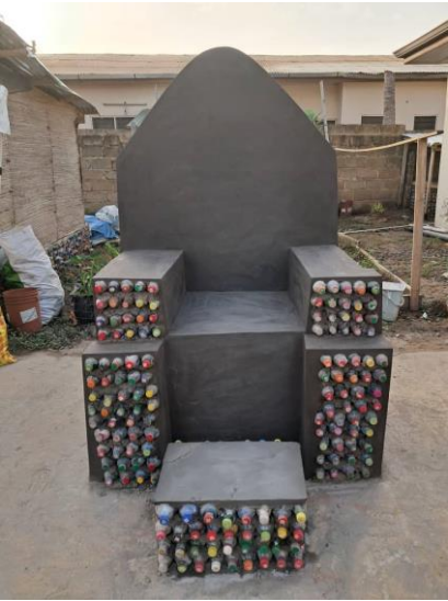
Smooth the patched surface as shown