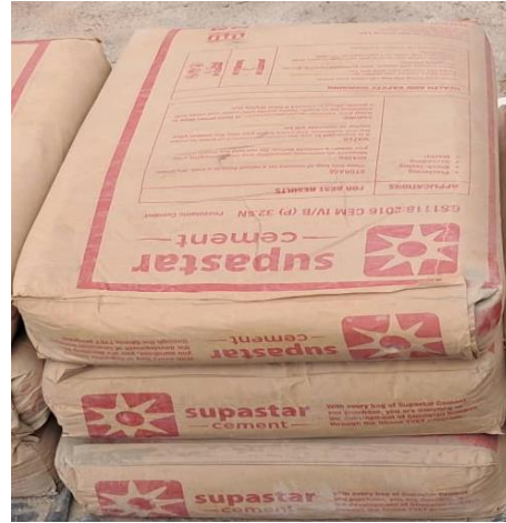
3 bags of cement