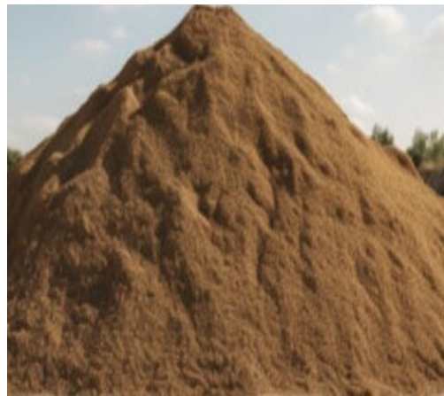
5 cubic yards sand