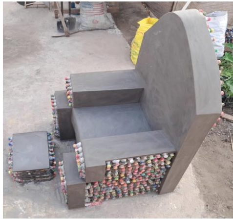
Fill the sit of throne with sand and cement throne