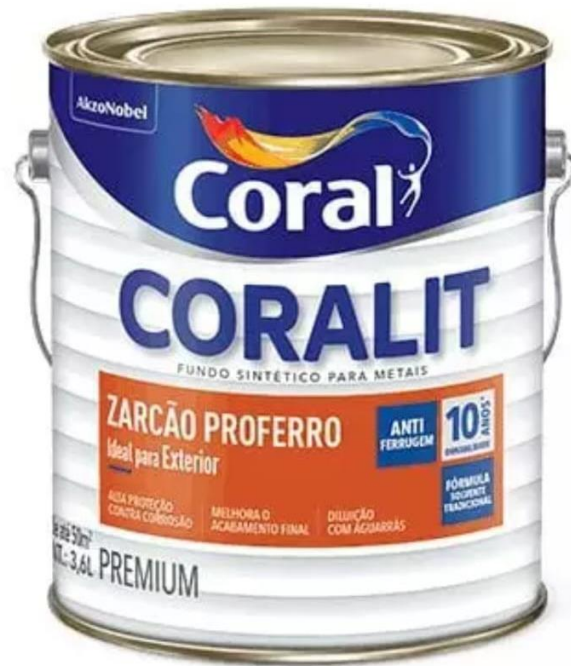
One gallon of paint