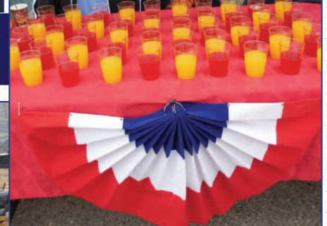
Key Club members are not only helpful, but they can set a beautiful table!