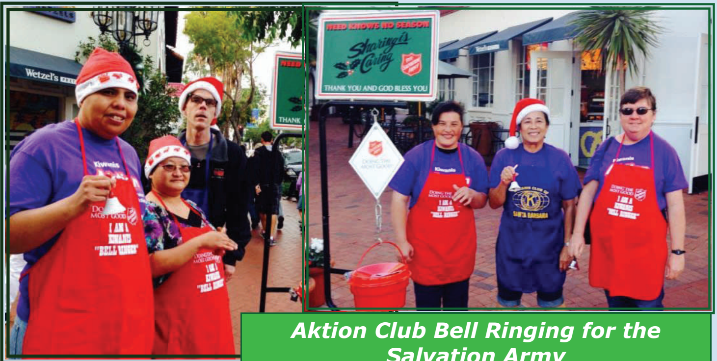
Aktion Club Bell Ringing for the Salvation Army

UCSB Circle K now has an additional 50 members. Their Installation Dinner last month was riotously fun.