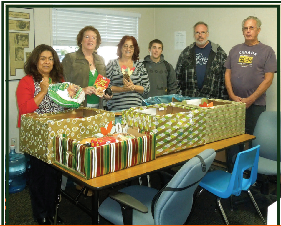
Thanksgiving Baskets for Simi Valley's Apollo High School Minor Parent Program Kiwanis of Santa Susana constructed 10 Thanksgiving baskets for each parent enrolled in Apollo High School's Minor Parent Program. The happy families will be having a wonderful turkey dinner with all the fixings.