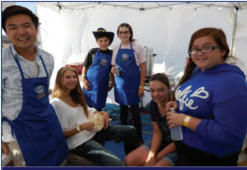
Students from Moorpark Key Club, Builders Club, and student volunteers help serve food at the Civil War Reenactment.