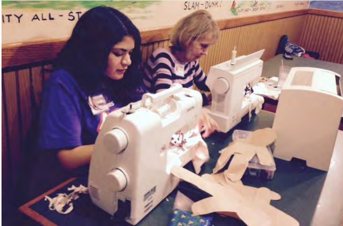
Aktion Club and UCSB-CKI Club

Club Advisors sewing patterns for anti-trauma dolls. It will be given to first responders for children of the community who are traumatized.