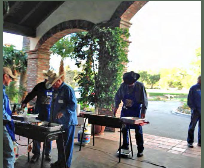
Some of the Simi team attending the Mid-Year Convention in Riverside!