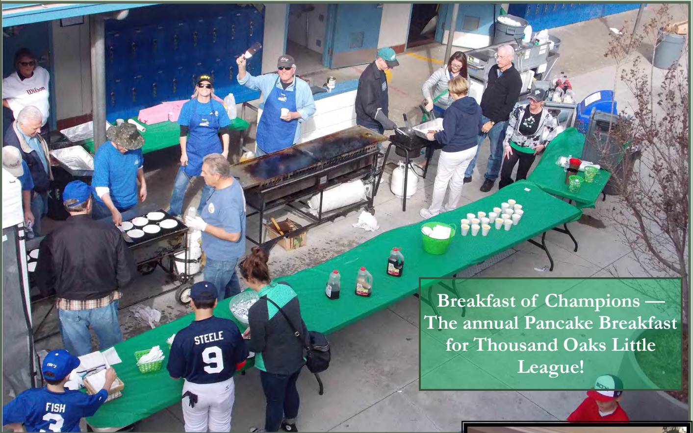
Breakfast of Champions — The annual Pancake Breakfast for Thousand Oaks Little League!

Lenore Lewis reporting