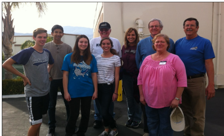
A few of the over twenty Kiwanis Family members joining to help Manna during the Boy Scouts Food Drive.

Our efforts were noticed and appreciated by Manna who has thanked us on their website and blog.