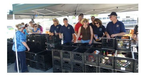
(2 & 3) Serving Veterans on Memorial Day, assisted by KIWINS;

Moorpark has been busy (1) packing food for Food Share;