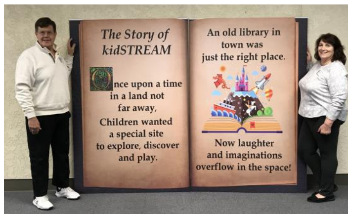
LTG Don and Lorraine at the kidSTREAM children's museum, promoting the First Lady's book-donating project