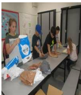
Mountain View K-Kids support the local animal shelter with donated plastic bags, blankets, and towels.