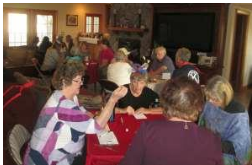
Members prepared a variety of finger foods, salads and desserts for our Annual High Tea Bunco. Twenty members and guests enjoyed food, fun and raised over $350.00 in support of our many children's programs.