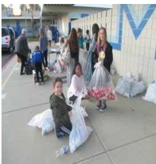
Madera K-Kids sort and count hundreds of bottles and cans collected for their Recycle For Charity Fundraising Program.