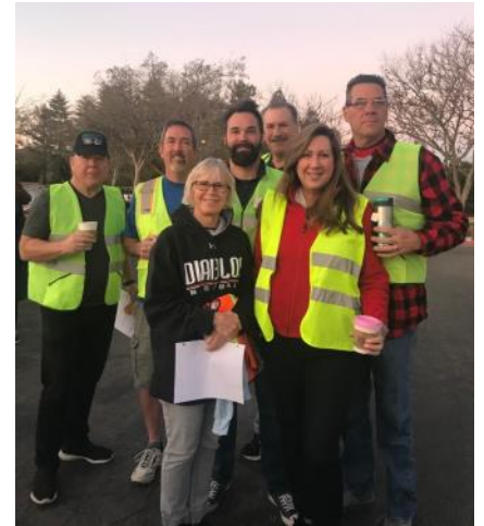
2020 Moorpark High School Groundhog Day 5K run traffic control volunteers!