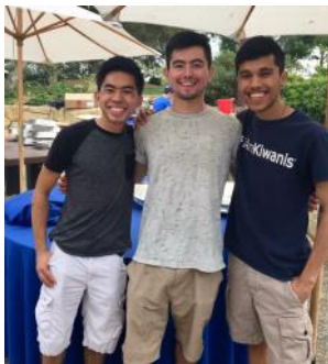
UCSB CKI Friendships