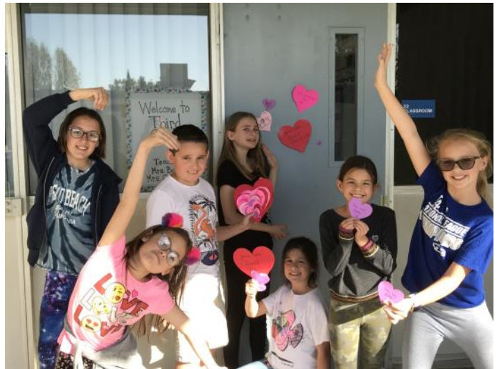
Township Elementary K-Kids... Heart Attacking classrooms for Valentines Day