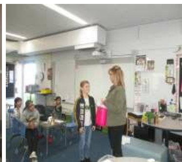
K-Kids at Mountain View and Madera had their own Bunco fun as part of their Valentine Social. Club Presidents presented Advisors with a special Valentine thank you treat. Santa Susana members then presented K-Kids their own treat bags.