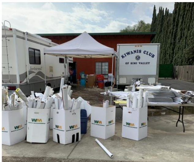
garage Cleaning day at the club's storage garage—getting ready for Round*Up