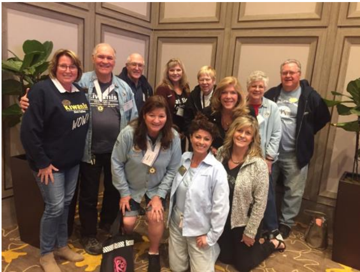
Members attending the Cal-NeV-Ha Mid-Year Conference—South in San Gabriel