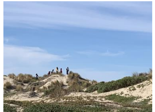
Jan 18: Key Club Beach Clean Up at Oxnard beach park