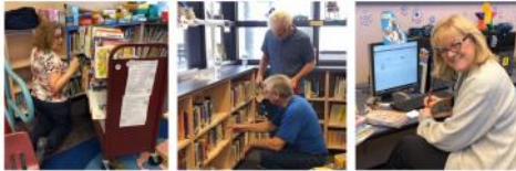
Moorpark Kiwanians are great librarians! We volunteer at various school libraries with cataloging, shelving, organizing and repairing books. Many hands make light work.