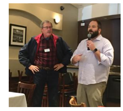
Our first evening meeting was super fun and filled with great energy. It was wonderful seeing so many members come out for the meeting.