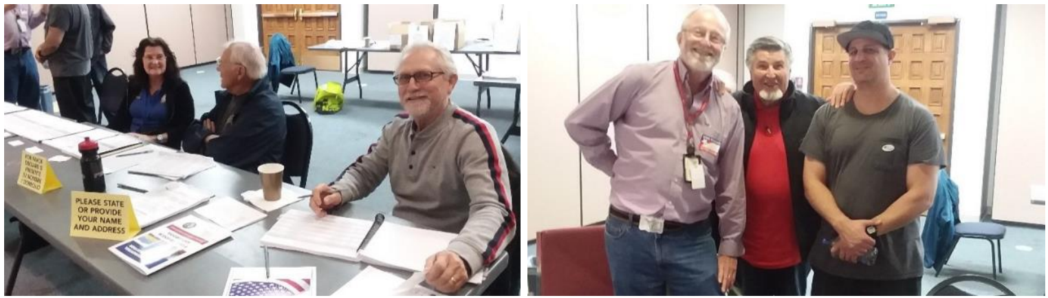
Evening shift waiting for last minute rush of voters and getting ready for a quick close down at 8:00 pm

In February the majority of our members were being trained on the revised polling process so that we were able to adopt a polling station on March 3. This is a simple way to raise money for either the Administrative or the Foundation account as the Club receives money from the County for the Kiwanis members' service.