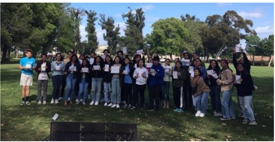
In February Kiwanis Club of Oxnard attended the Key Club DCM held at Hobert Park in Ventura. The students held a rally and also made cards for children that are hospitalized.