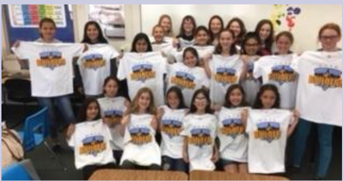
The Builders Club at DATA Middle School made Teacher Appreciation Rock paperweights for the school staff, and showed off their new T-shirts.