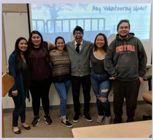
New officers were installed for the upcoming year for our Circle K club.