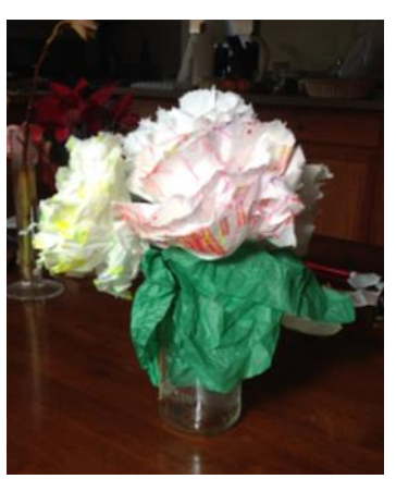
The finished product that was distributed at the dance.