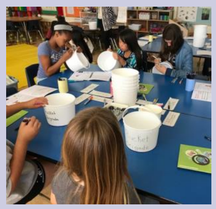
Juanamaria Elementary K-Kids work on their Bucket Brigade project.