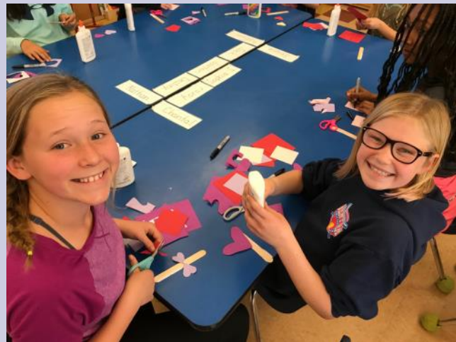
Juanamaria K-Kids making tray favors for hospitalized children