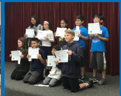
Terrific Kids is a fantastic program we sponsor at all our elementary schools in Moorpark!