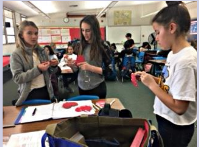
Members of DATA BUILDERS CLUB making Valentine thank you for the firefighters and Sheriff's Deputies for their services especially during the Thomas Fire in Ventura