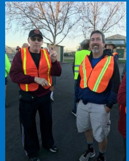
Moorpark Kiwanis club members volunteer at the annual Groundhog Day 5K race on February 3. Proceeds benefit the Moorpark High School track and cross country teams.