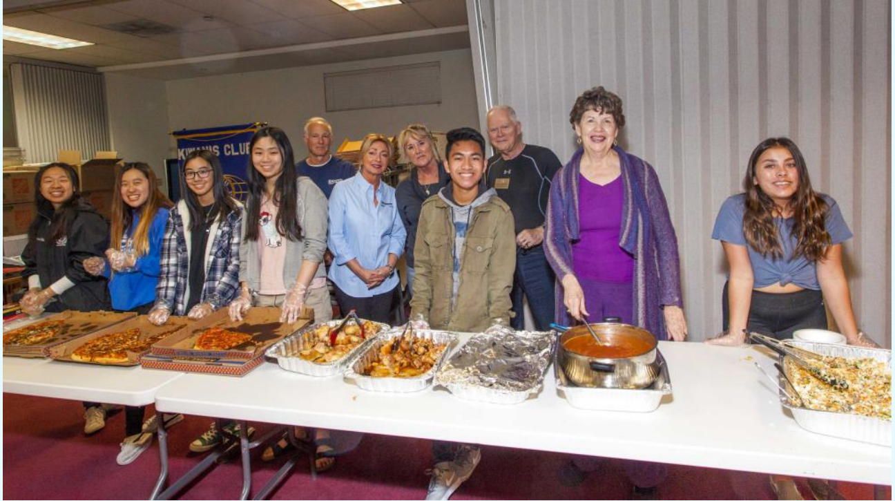
On January 22 at the Chinese Christian Church we fed the needy, as we do every other month in partnership with Lutheran Social Services, with the Newbury Park High School Key Club serving up the pizza and chicken.