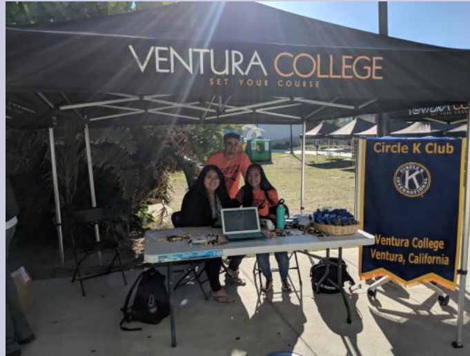
Circle K students man the booth for Student Life Day at Ventura College to recruit new members.